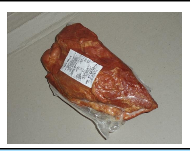
Finished Product in Carton